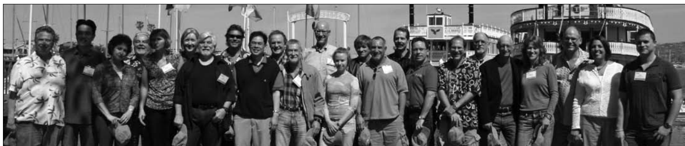
2009 CSAM LEADERSHIP DEVELOPMENT RETREAT, SAN DIEGO